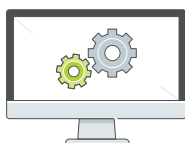
Proactive Planning Recommendations

“Beam has made RI purchase & planning process very convenient for us. Now we have a better visibility & control on our cloud spend. Managing cloud is now simple with Beam”