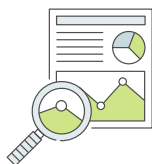
Deep Visibility Into Consumption